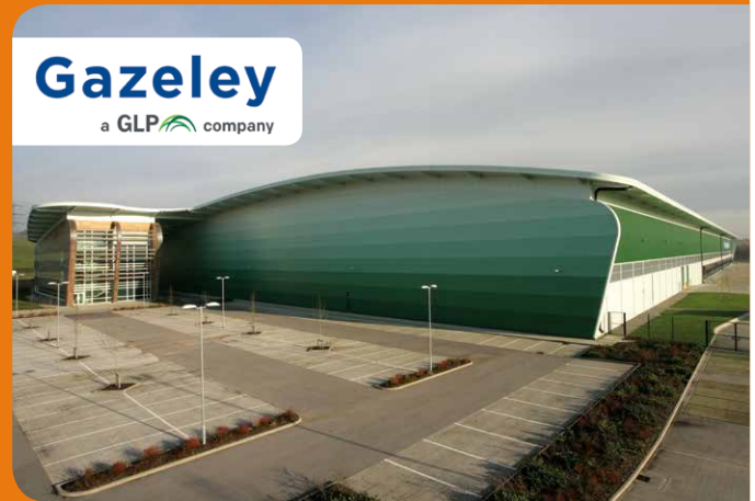
Gazeley's G Park Stoke

Gazeley has successfully developed a number of high-performing and well-regarded locations in the UK. Perhaps best-known in the East Midlands area are its Magna Park developments at Lutterworth and Milton Keynes.