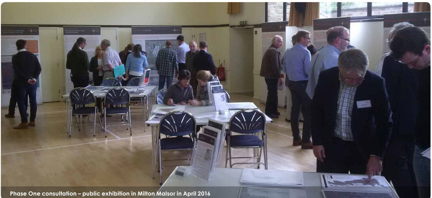
Phase One consultation – public exhibition in Milton Malsor in April 2016

Consultation and feedback are central to the planning process for NSIPs. All comments, views and feedback from the local community, as well as a wide range of other stakeholders, will be considered as we develop the proposals. All feedback will be recorded and reported in the Consultation Report.